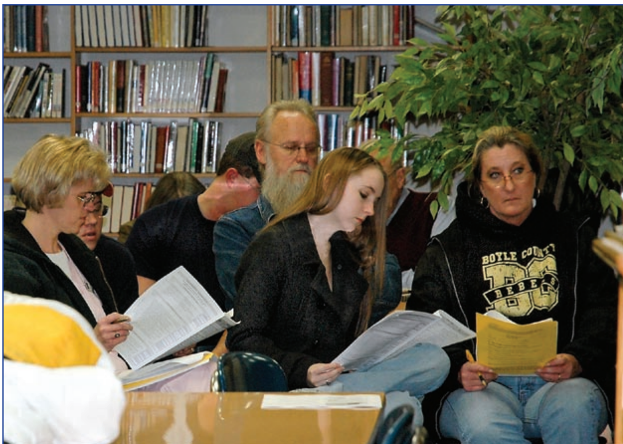
Parents of Boyle County seniors learn about financial aid options at a Free Application for Federal Student Aid (FAFSA) workshop sponsored by KHEAA and The Student Loan People.

Three kinds of parental involvement at home are consistently associated with higher student achievement: actively organizing and monitoring a child's time,