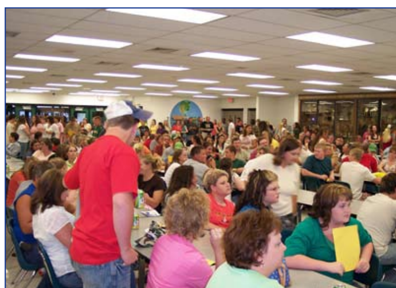
Great Turnout - Green County High School 101

By the turnout at its High School 101 program last fall, it looks like GCHS is well