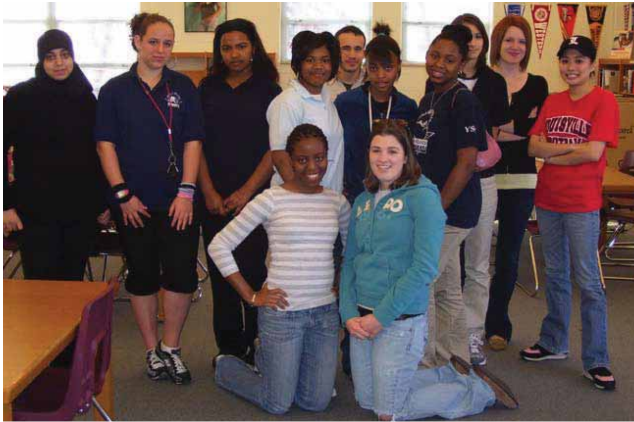
Iroquois Middle School mentoring group