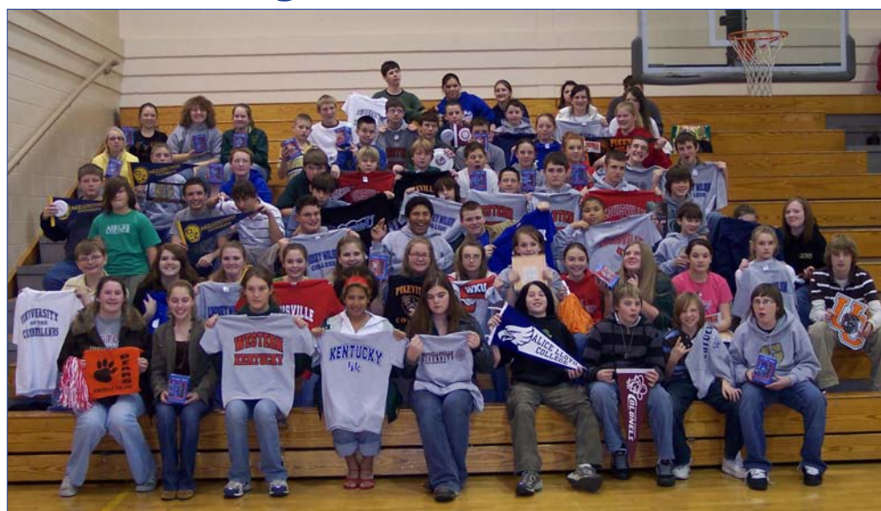
Future Green County High School students who won college gear during their Green County Middle School College Week.