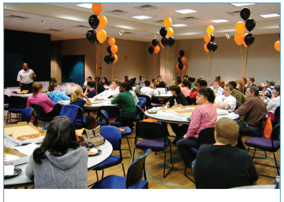
Northern Kentucky University hosted College 101/102 for students and parents to learn how to plan for college last month.